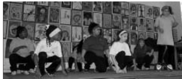
Fifth and sixth grade hip-hop girls perform on stage.

Students raised their voices in song in two musical productions. Under the direction of music teacher, Ed Nardi, Pre-Kindergarten and Kindergarten students performed "Jungle Party Tonight" to an enthusiastic audience. Students in first through sixth grade re-created River City — right here in Lansdowne — in their performance of "The Music Man."